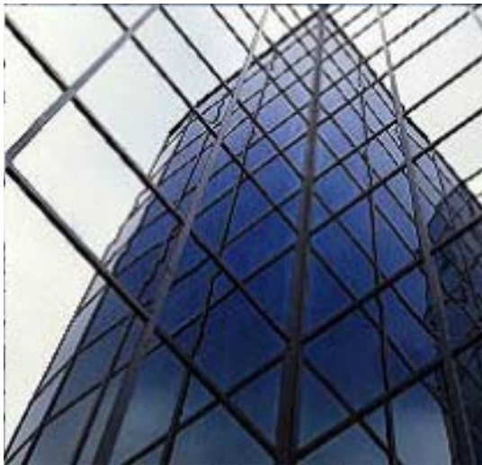
Panels & Roofing